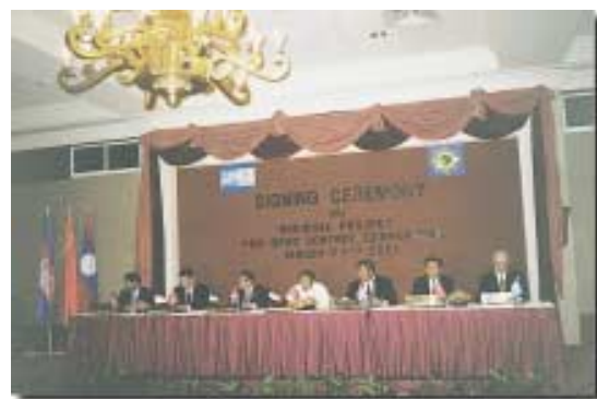
The Ministers of the 6 MOU signatory countries and UNDCP representative had signed the Precursors Control in East and Southeast Asia Project Document during the Ministerial Meeting on May 11, 2001 at Yangon, Union of Myanmar

During 19-20 May 2000, the National Authority for Combating Drugs and the Cambodian Government hosted the Senior Officials Committee (SOC) Meeting in Phnom Penh. New projects and initiatives were discussed. The meeting also elaborated on the need to develop joint actions against the threats that organized crime is exposing the region too. Transnational criminal syndicates are increasingly concentrating