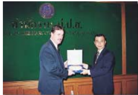
Mr. Mick Keelty, Commissioner Australian Federal Police visited ONCB on April 30, 2001.

Mr. Mick Keelty, Commissioner of Australian Federal Police (AFP)