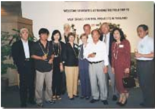
A group of Ambassador mission from Vienna, Austria during 24-28 May 2001